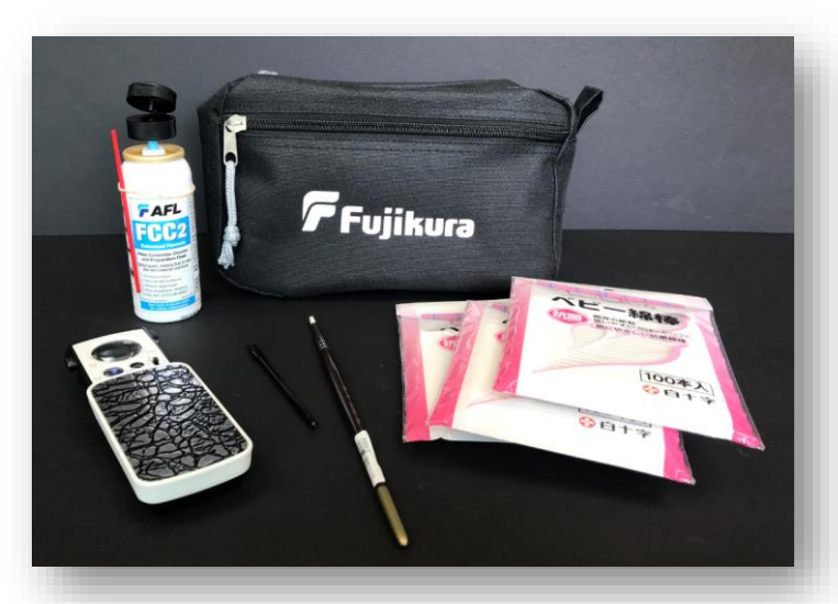
All items can be re-ordered as separate consumables

Fujikura Europe Ltd C51 Barwell Business Park Leatherhead Road Chessington, Surrey KT9 2NY